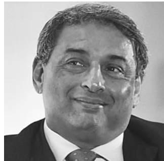
"We are coming out with some new policies effective November 1, which we will try for a year. It will give people a lot of flexibility to decide"